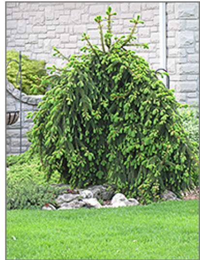
Weeping Norway Spruce

Weeping Norway Spruce will grow to be about 25 feet tall at maturity, with a spread of 10 feet. It has a low canopy, and should not be planted underneath power lines. It grows at a slow rate, and under ideal conditions can be expected to live for 60 years or more.