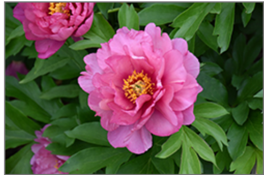
Keiko Peony flowers