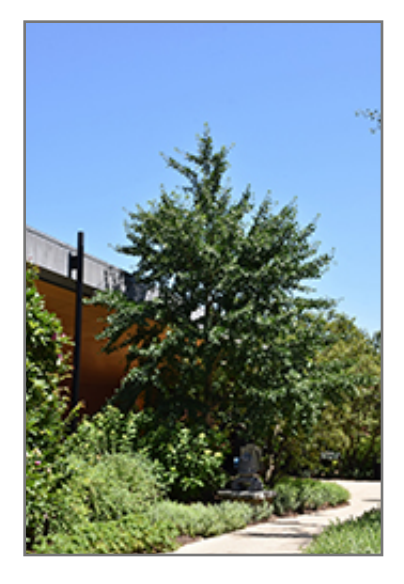
Autumn Gold Ginkgo

2608 Hikes Lane Louisville, KY 40218 (502) 454-3553