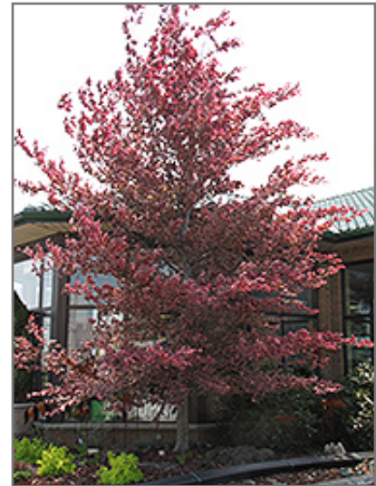
Tricolor Beech