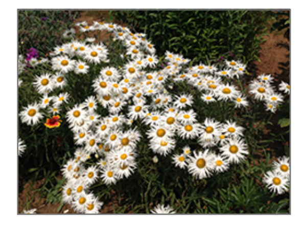
Crazy Daisy Shasta Daisy in bloom