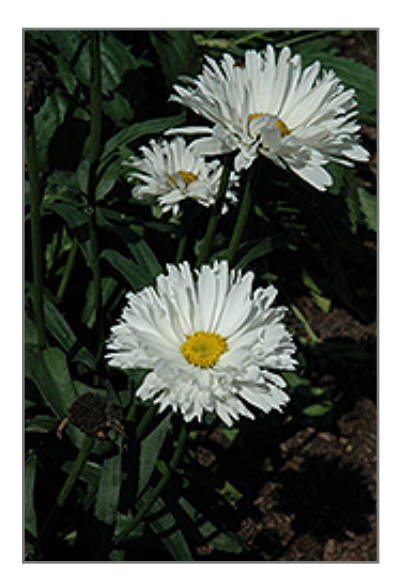
Crazy Daisy Shasta Daisy flowers