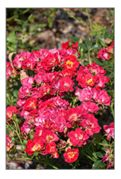
Pink Drift Rose flowers

Pink Drift Rose is recommended for the following landscape applications;