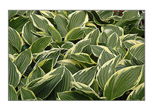
Golden Variegated Hosta foliage