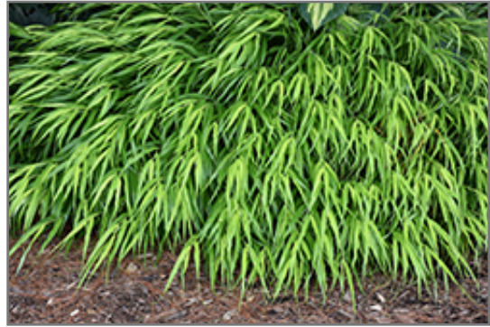
All Gold Hakone Grass foliage