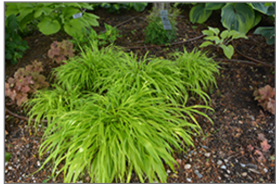
All Gold Hakone Grass