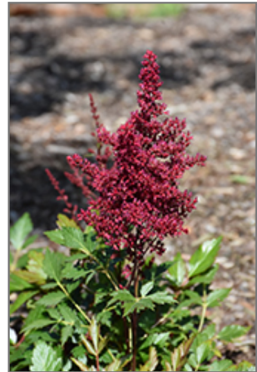
Red Sentinel Astilbe flowers

Red Sentinel Astilbe is a fine choice for the garden, but it is also a good selection for planting in outdoor pots and containers. With its upright habit of growth, it is best suited for use as a 'thriller' in the 'spiller-thriller-filler' container combination; plant it near the center of the pot, surrounded by smaller plants and those that spill over the edges. Note that when growing plants in outdoor containers and baskets, they may require more frequent waterings than they would in the yard or garden.