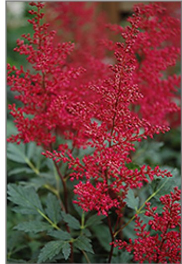
Red Sentinel Astilbe flowers

Red Sentinel Astilbe is recommended for the following landscape applications;