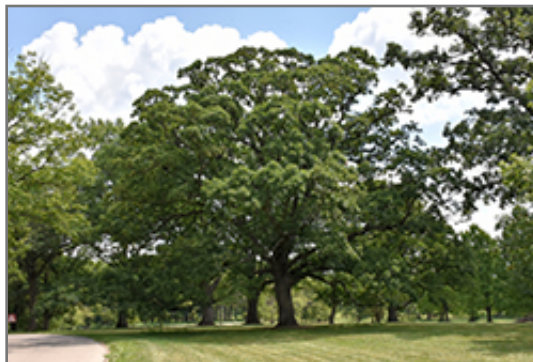
White Oak Photo courtesy of NetPS Plant Finder