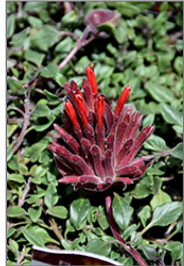
Marian Sampson Scarlet Monardella flowers

This is a relatively low maintenance plant, and should not require much pruning, except when necessary, such as to remove dieback. It is a good choice for attracting hummingbirds to your yard. It has no significant negative characteristics.