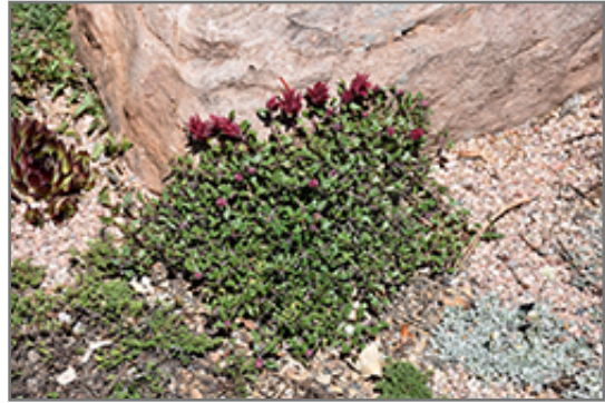
Marian Sampson Scarlet Monardella in bloom

Marian Sampson Scarlet Monardella is a fine choice for the garden, but it is also a good selection for planting in outdoor pots and containers. Because of its spreading habit of growth, it is ideally suited for use as a 'spiller' in the 'spiller-thriller-filler' container combination; plant it near the edges where it can spill gracefully over the pot. Note that when growing plants in outdoor containers and baskets, they may require more frequent waterings than they would in the yard or garden.