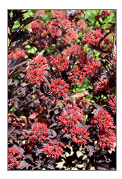
Center Glow Ninebark fruit