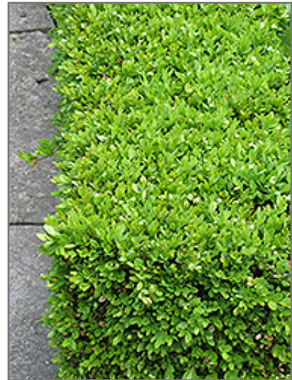
Green Velvet Boxwood foliage