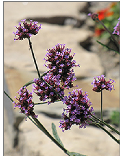
Tall Verbena flowers