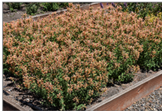
Kudos Gold Hyssop in bloom