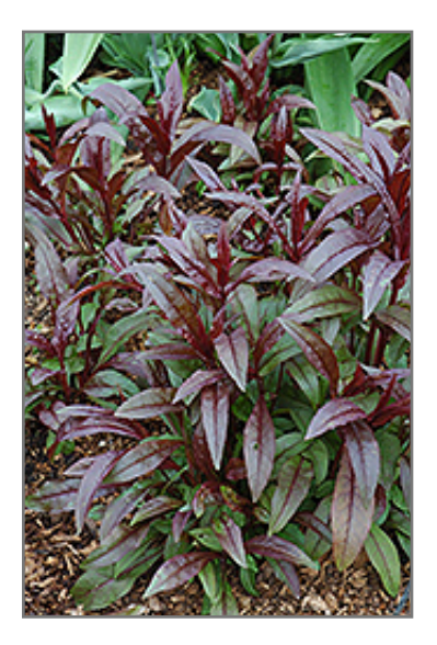
Husker Red Beard Tongue foliage

2608 Hikes Lane Louisville, KY 40218 (502) 454-3553