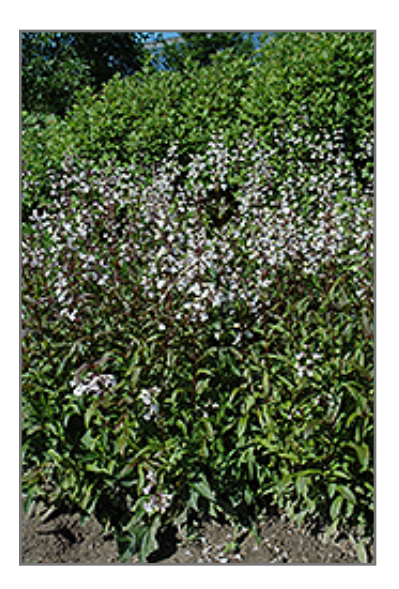
Husker Red Beard Tongue in bloom

This plant does best in full sun to partial shade. It prefers dry to average moisture levels with very well-drained soil, and will often die in standing water. It is considered to be drought-tolerant, and thus makes an ideal choice for a low-water garden or xeriscape application. It is not particular as to soil type or pH. It is somewhat tolerant of urban pollution. This is a selection of a native North American species. It can be propagated by cuttings; however, as a cultivated variety, be aware that it may be subject to certain restrictions or prohibitions on propagation.