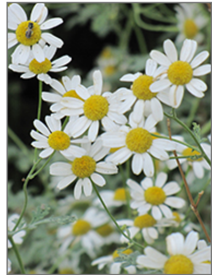
German Chamomile flowers