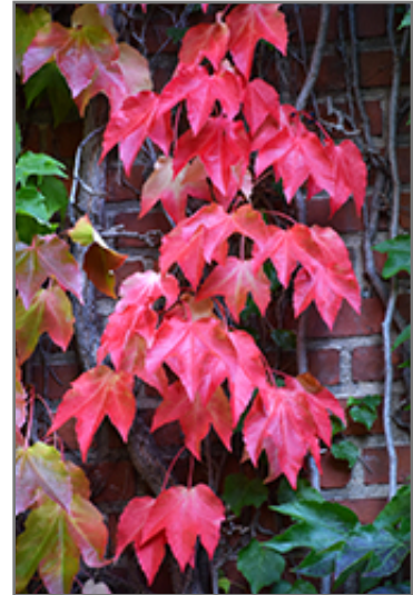
Boston Ivy in fall