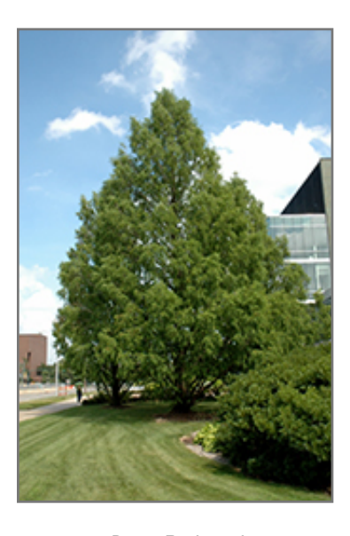
Dawn Redwood