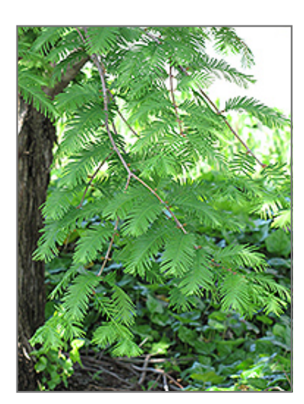
Dawn Redwood foliage