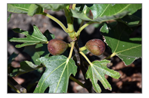
Little Miss Figgy Fig fruit

Little Miss Figgy Fig has attractive dark green foliage with light green veins on a plant with a round habit of growth. The small lobed leaves are highly ornamental but do not develop any appreciable fall color. The fruits are showy deep purple pomes carried in abundance from late summer to late fall. The fruit can be messy if allowed to drop on the lawn or walkways, and may require occasional clean-up.