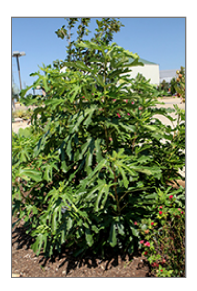
Little Miss Figgy Fig

2608 Hikes Lane Louisville, KY 40218 (502) 454-3553