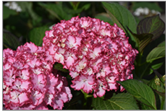
Seaside Serenade Fire Island Hydrangea flowers

This shrub will require occasional maintenance and upkeep, and should only be pruned after flowering to avoid removing any of the current season's flowers. It has no significant negative characteristics.