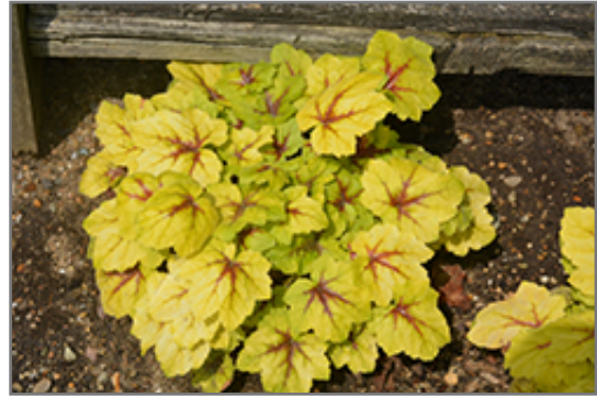
Catching Fire Foamy Bells

This is a relatively low maintenance plant, and should be cut back in late fall in preparation for winter. It is a good choice for attracting hummingbirds to your yard. It has no significant negative characteristics.