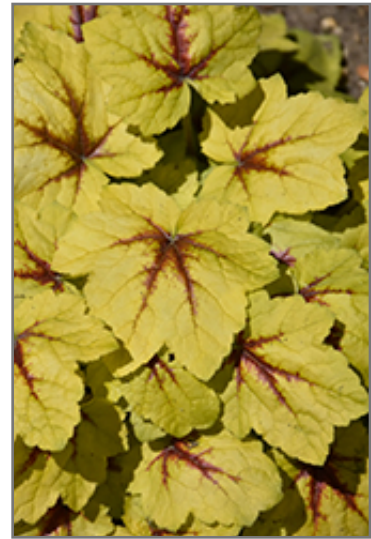
Catching Fire Foamy Bells foliage