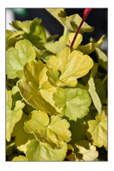
Dolce Appletini Coral Bells foliage

Dolce Appletini Coral Bells will grow to be about 10 inches tall at maturity extending to 20 inches tall with the flowers, with a spread of 24 inches. When grown in masses or used as a bedding plant, individual plants should be spaced approximately 18 inches apart. Its foliage tends to remain low and dense right to the ground. It grows at a medium rate, and under ideal conditions can be expected to live for approximately 10 years. As an evegreen perennial, this plant will typically keep its form and foliage year-round.