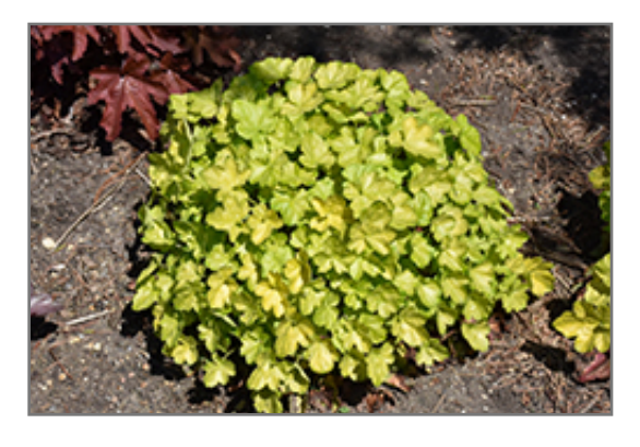
Dolce Appletini Coral Bells