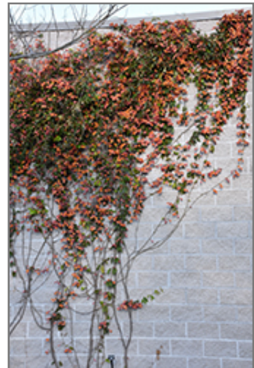
Tangerine Beauty Cross Vine in bloom