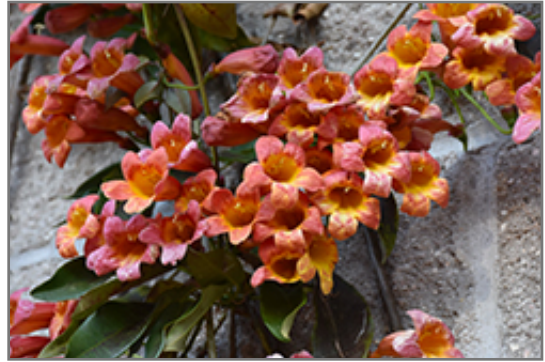
Tangerine Beauty Cross Vine flowers

This woody vine does best in full sun to partial shade. It is very adaptable to both dry and moist growing conditions, but will not tolerate any standing water. It is not particular as to soil type, but has a definite preference for acidic soils. It is highly tolerant of urban pollution and will even thrive in inner city environments. This is a selection of a native North American species.