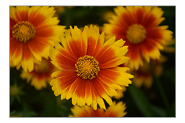
UpTick Gold and Bronze Tickseed flowers

UpTick Gold and Bronze Tickseed is recommended for the following landscape applications;