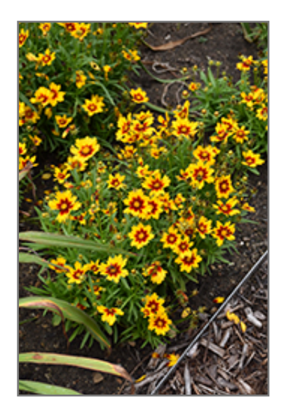
UpTick Gold and Bronze Tickseed in bloom

This plant should only be grown in full sunlight. It does best in average to evenly moist conditions, but will not tolerate standing water. It is not particular as to soil pH, but grows best in poor soils. It is somewhat tolerant of urban pollution. This particular variety is an interspecific hybrid. It can be propagated by division; however, as a cultivated variety, be aware that it may be subject to certain restrictions or prohibitions on propagation.