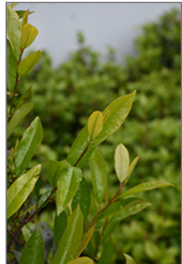
Bright 'N Tight Carolina Laurel foliage