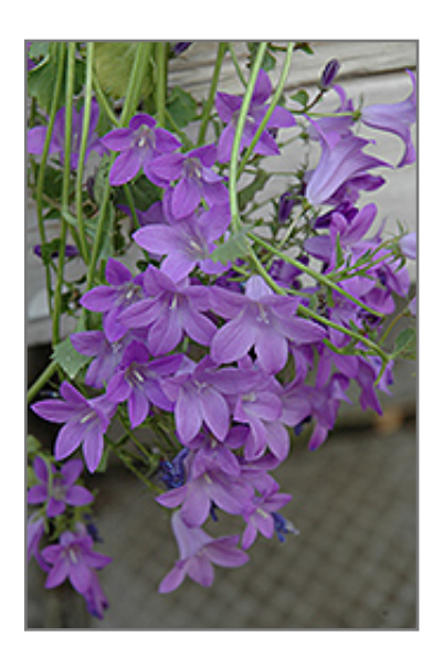
Birch Hybrid Bellflower flowers

Birch Hybrid Bellflower is recommended for the following landscape applications;