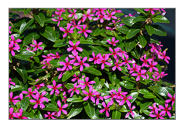
Soiree Kawaii Lavender Vinca flowers