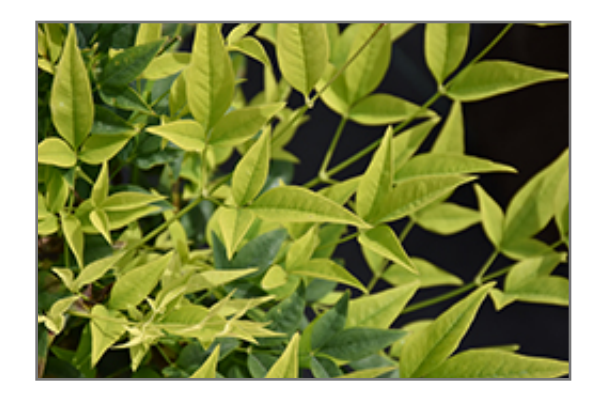
Lemon Lime Nandina foliage

Lemon Lime Nandina is recommended for the following landscape applications;