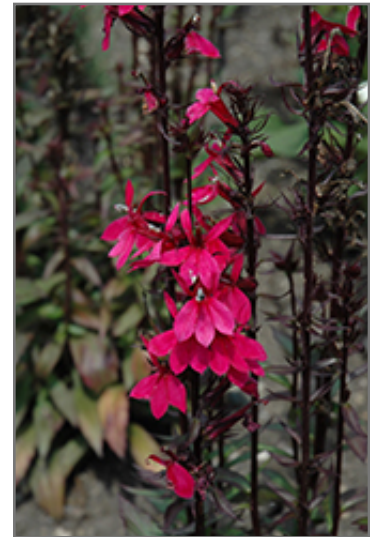
Starship Deep Rose Lobelia flowers

Starship Deep Rose Lobelia is recommended for the following landscape applications;