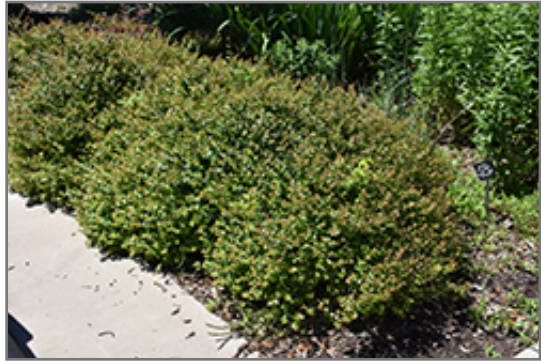
Rose Creek Abelia

Rose Creek Abelia makes a fine choice for the outdoor landscape, but it is also well-suited for use in outdoor pots and containers. Because of its height, it is often used as a 'thriller' in the 'spiller-thriller-filler' container combination; plant it near the center of the pot, surrounded by smaller plants and those that spill over the edges. It is even sizeable enough that it can be grown alone in a suitable container. Note that when grown in a container, it may not perform exactly as indicated on the tag - this is to be expected. Also note that when growing plants in outdoor containers and baskets, they may require more frequent waterings than they would in the yard or garden.