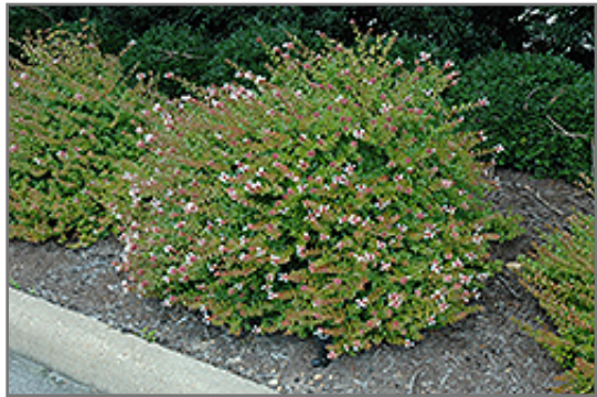
Rose Creek Abelia in bloom

Rose Creek Abelia is recommended for the following landscape applications;