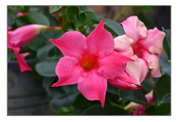
Pink Mandevilla flowers

This plant is native to the tropics and prefers growing in moist environments with evenly warm conditions all year round. In our climate, it is usually grown as an outdoor annual in the garden or in a container. If you want it to survive the winter, it can be brought in to the house and provided with special care, and then returned to the garden the following season. In its preferred tropical habitat, it can grow to be around 10 feet tall at maturity, with a spread of 24 inches. However, when grown as an annual or when overwintered indoors, it can be expected to perform differently, and its exact height and spread will depend on many factors; you may wish to consult with our experts as to how it might perform in your specific application and growing conditions.