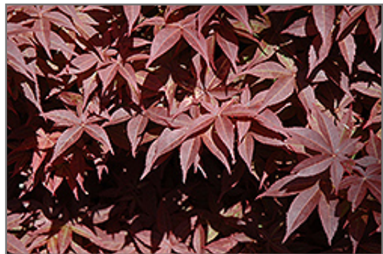
Rhode Island Red Japanese Maple foliage