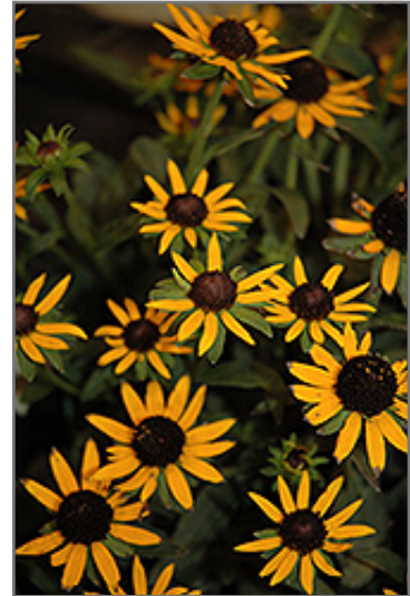
Little Goldstar Coneflower flowers