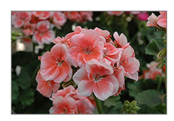
Classic Salmon Geranium flowers

A classic selection for annual containers, baskets, and beds; well branched plants with medium vigor; bright salmon flower clusters provide all season color