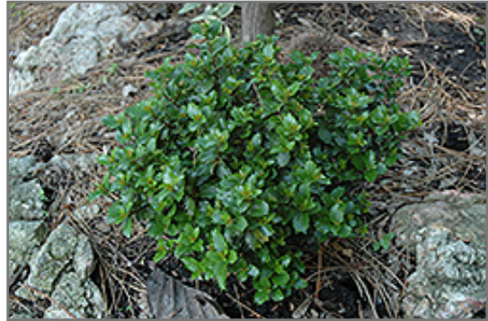
Little Rascal Meserve Holly