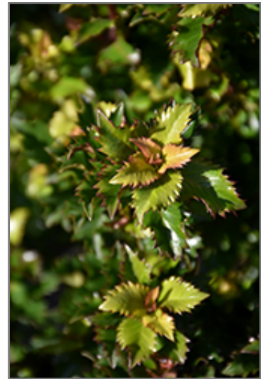
Little Rascal Meserve Holly foliage