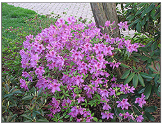
Girard's Karen Azalea in bloom

This is a relatively low maintenance shrub, and should only be pruned after flowering to avoid removing any of the current season's flowers. It has no significant negative characteristics.