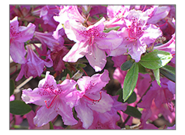
Girard's Karen Azalea flowers

Girard's Karen Azalea is an open multi-stemmed evergreen shrub with an upright spreading habit of growth. Its relatively coarse texture can be used to stand it apart from other landscape plants with finer foliage.